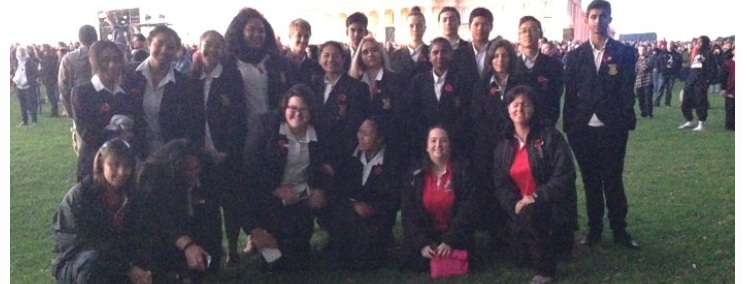
Student group at Dawn Parade—Auckland Domain

We certainly couldn't have done it without the input and support we receive from the local schools – we so truly appreciate it.