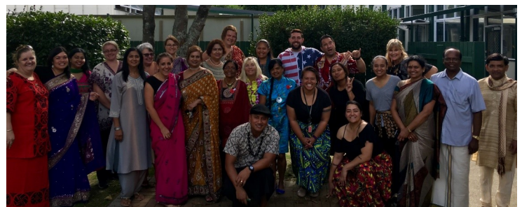
Staff in national costume