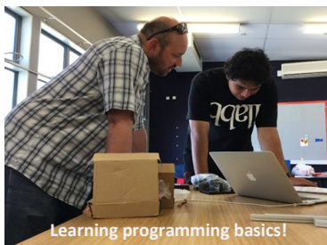
Learning programming basics!

While attending FPSIC 2017, I enjoyed the immersion in a new environment. I liked sightseeing in Chicago, observing local landmarks in LaCrosse and talking to people from all around the country. The cultural demographic of the States, being largely different to New Zealand's, fascinated me. Likewise, Americans were awed by my accent and background. The bonds I made with people at FPSIC will always serve as a reminder of the potential our generation has, and the common shared interest between us: solving the problems of the future.