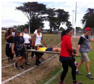
One Day Leadership Challenge

Pacific Expo —Monday 23 June 4-7pm @ Hotel Grand Chancellor, Mangere