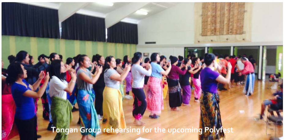
Tongan Group rehearsing for the upcoming Polyfest