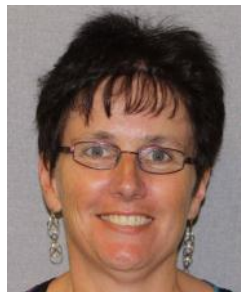
Mrs Katherine Wilson Integrated Learning Centre